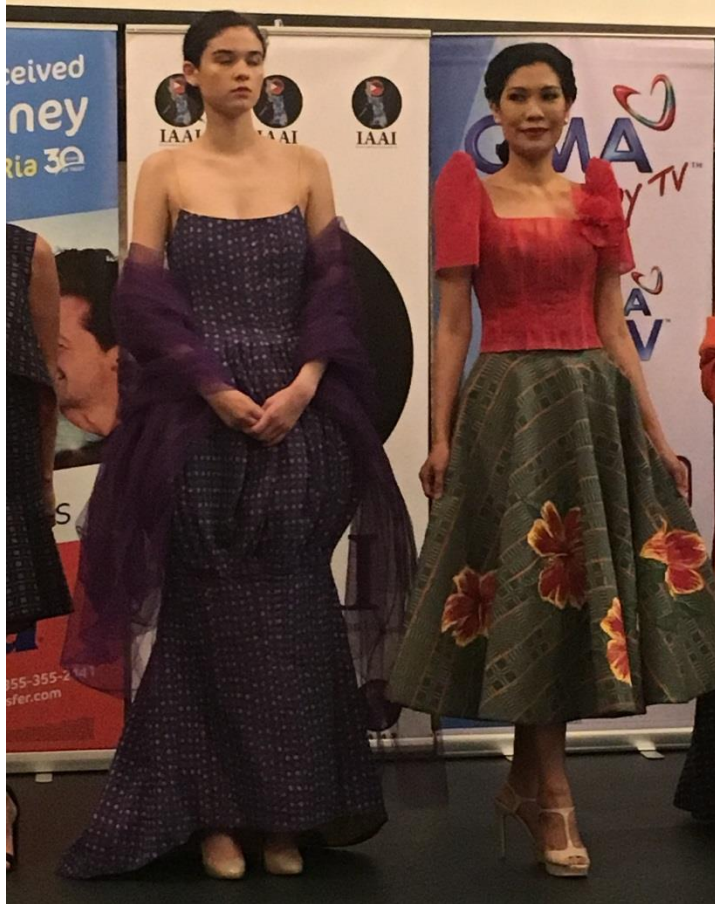
Models from the Filipino-American Community wearing the Inabel creations during the event entitled "A Taste of Ilocano Food and Culture)

For more information, visit www.newyorkpcg.org and www.facebook.com/PHConsulateNY