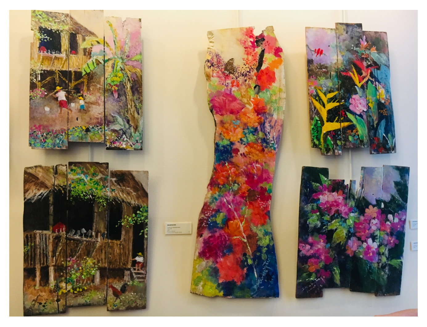
Among the paintings featured at the exhibit Milestones: A Celebration of Life (clockwise)Childhood Memories (Sa Bukid), Resurfacing, Mythical Creatures, and Childhood Memories (Series).