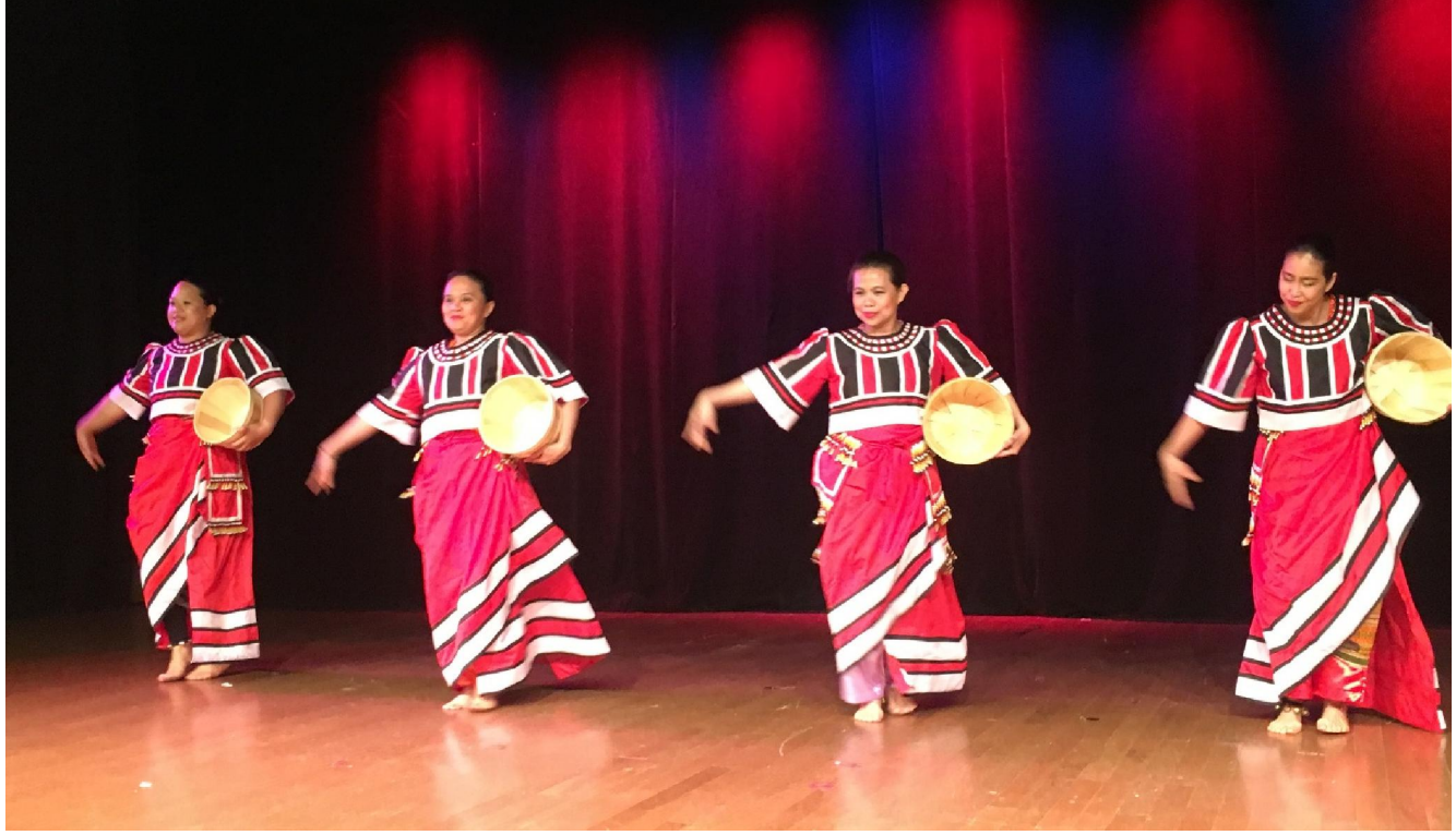
TeatroKandusay (Kanta, Dula at Sayaw) represented SocSkSargen USA, Inc. and performedBukidnon traditional dances namely Dugso , a ceremonial dance for thanksgiving and prayer for protection during important occasion and Agtatanum , a celebration of a bountiful harvest among the Manobo people in Bukidnon.

The afternoon event was attended by the greater South Hampton community. END