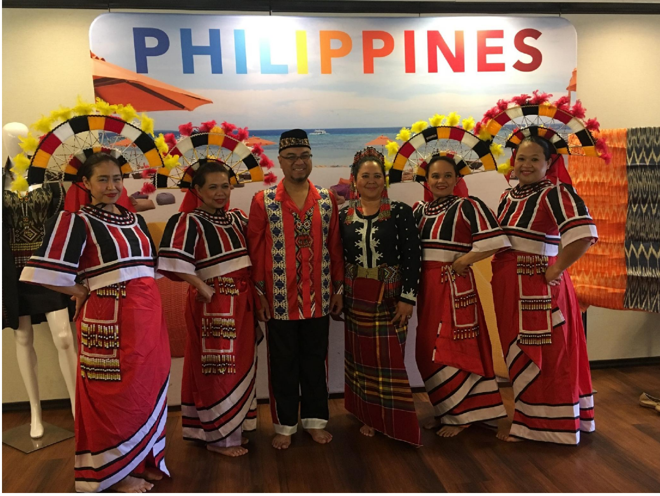
TeatroKandusay (Kanta, Dula at Sayaw) represented SocSkSargen USA, Inc. rendered a celebration of a bountiful harvest in their T'boli traditional dresses.