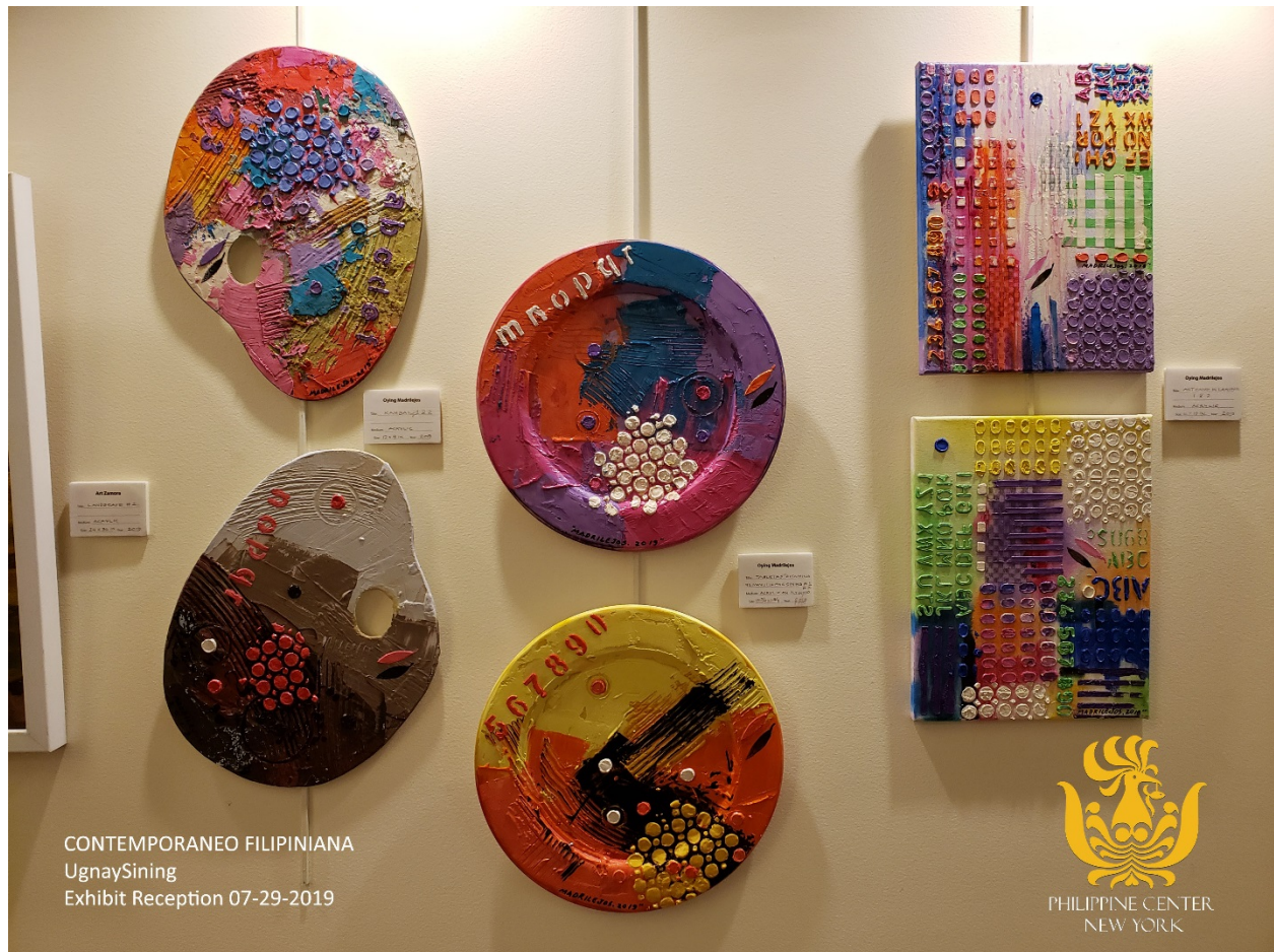
OyingMadrilejos' acrylic paintings on plywood.

Am artists by providing them the venue where they can promote their artwork to the Fil-Am community and mainstream American public. - END