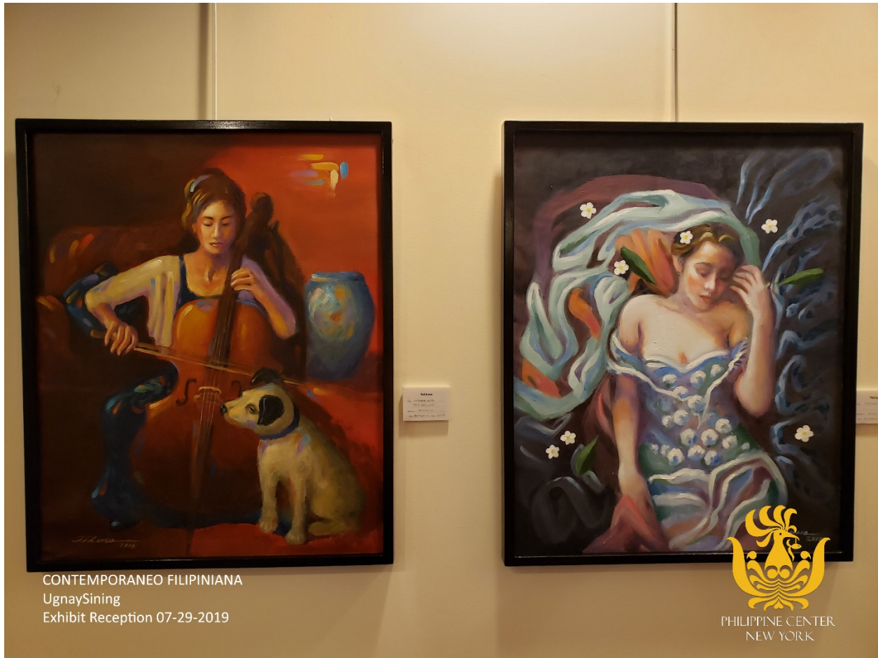
CONTEMPORANEO FILIPINIANA UgnaySining Exhibit Reception 07-29-2019