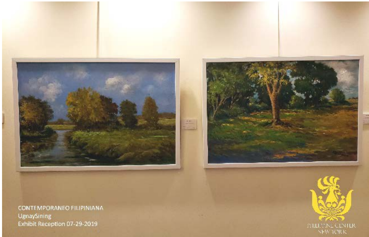
Art Zamora's landscape acrylic paintings.