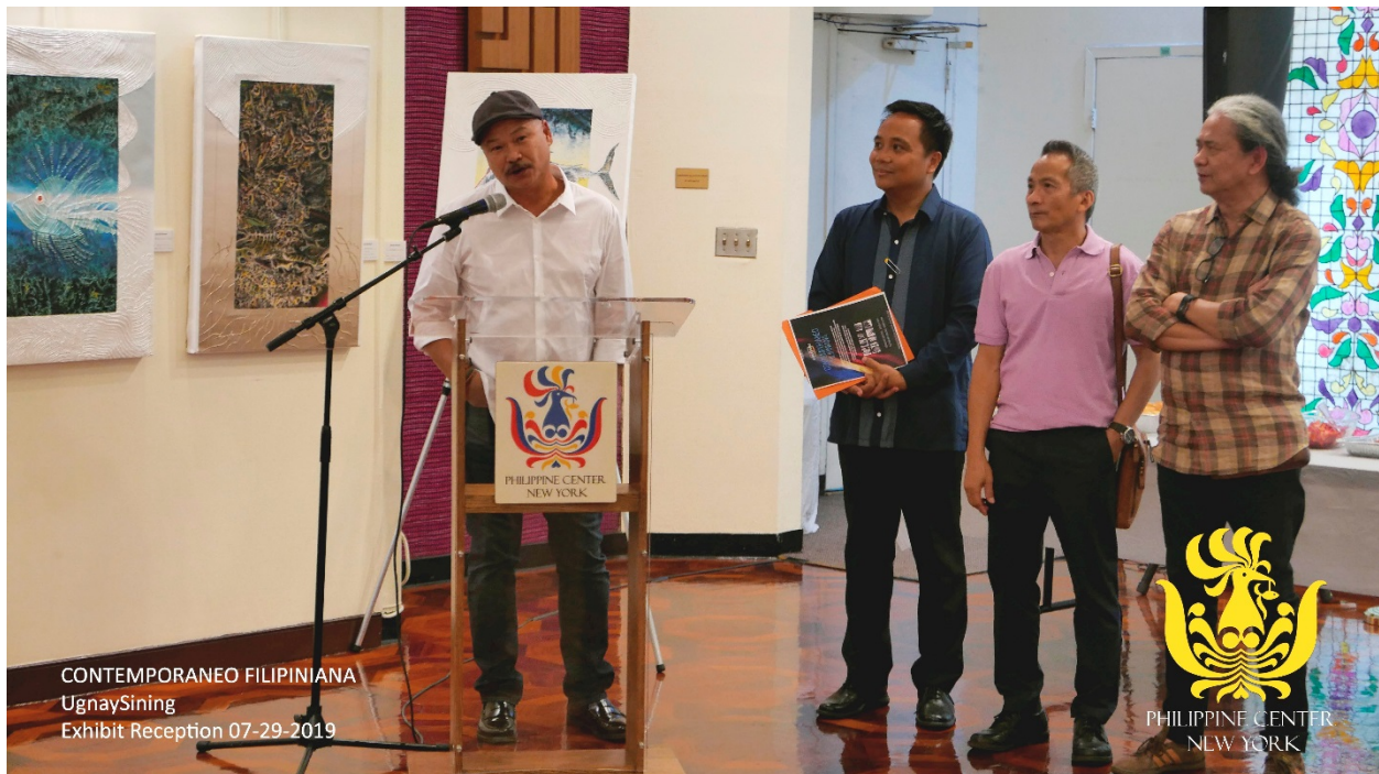
CONTEMPORANEO FILIPINIANA UgnaySining Exhibit Reception 07-29-2019