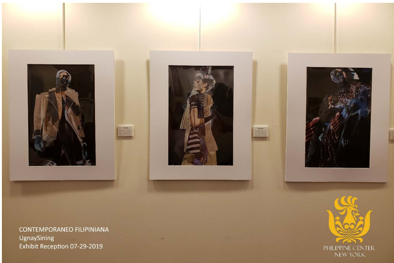
CONTEMPORANEO FILIPINIANA UgnaySining Exhibit Reception 07-29-2019