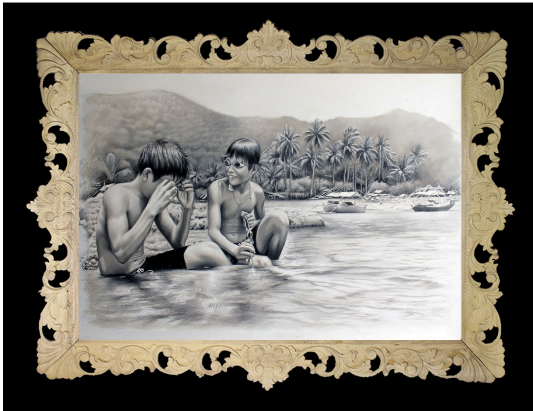
Mga katutubong bata na nagsisibat pangingisda sa Dibut dagat-dagatan. Probinsya ng Aurora.

The exhibit will run until 11 October 2019. END.